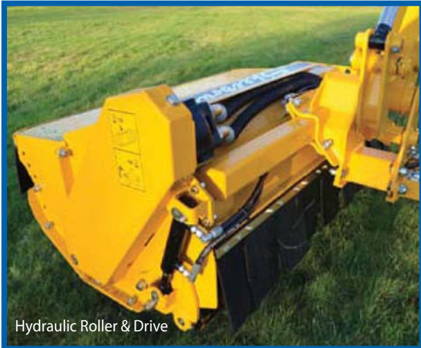
Hydraulic Roller & Drive