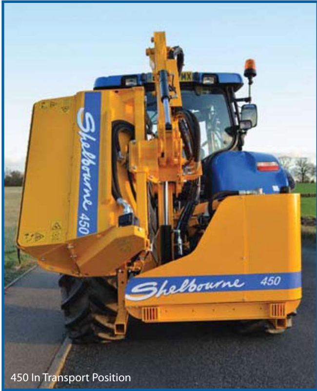
450 In Transport Position