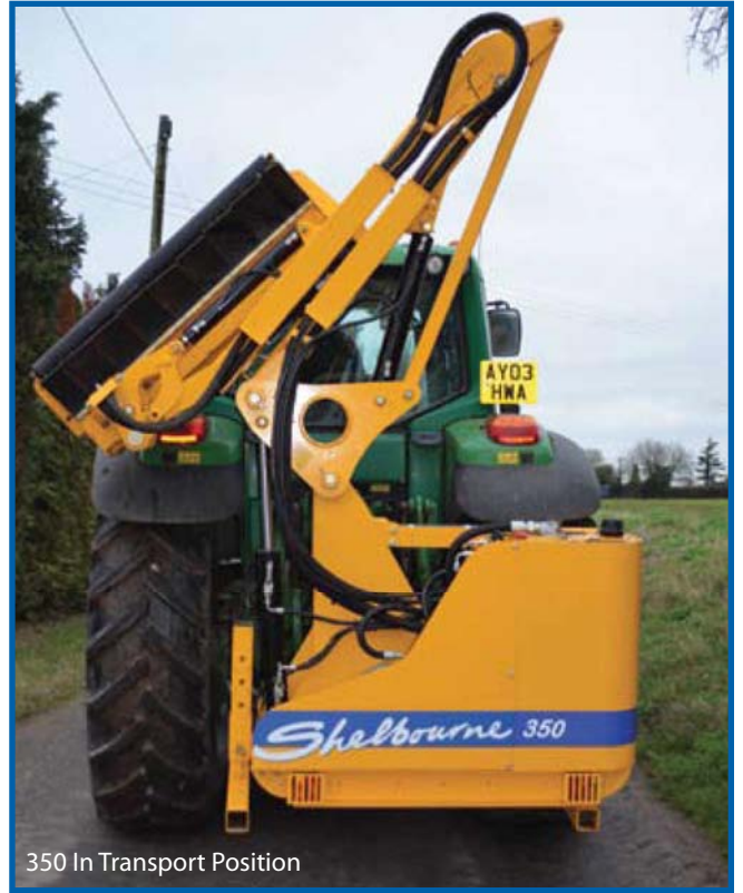
350 In Transport Position