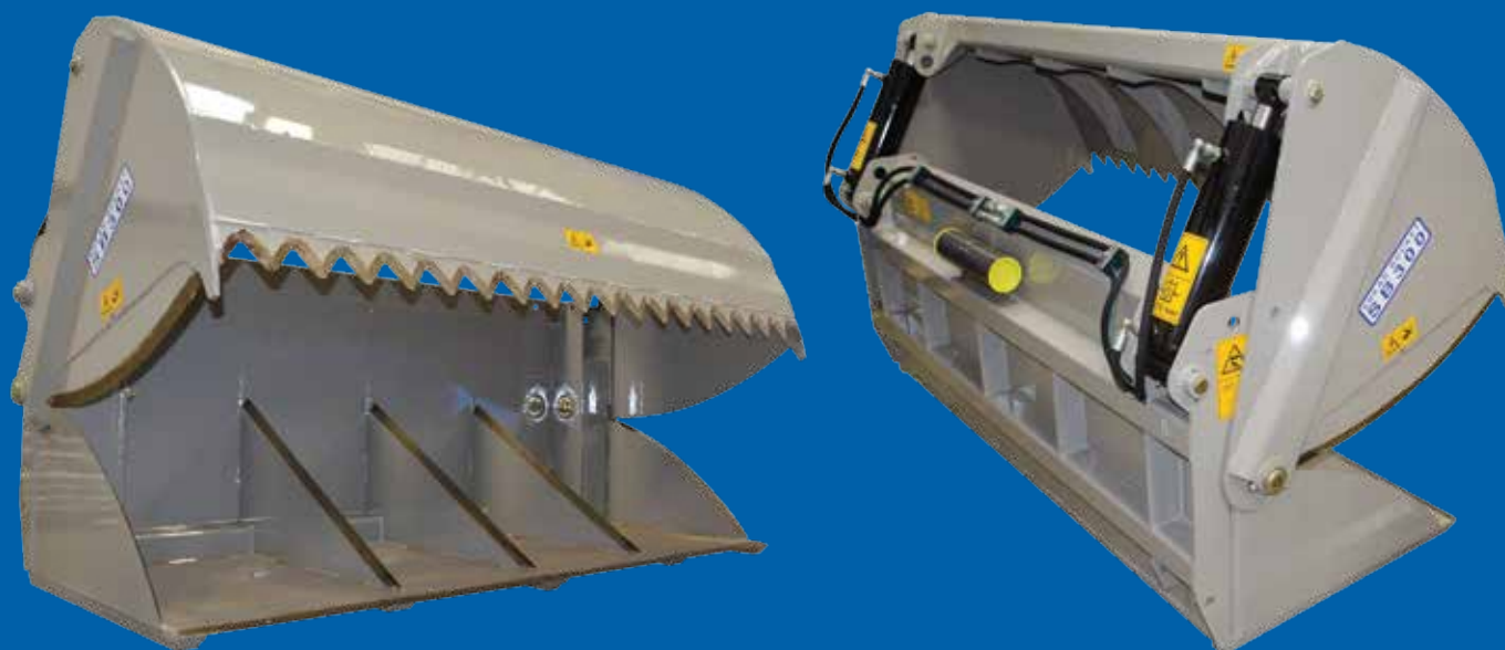
Shear Bucket SB300