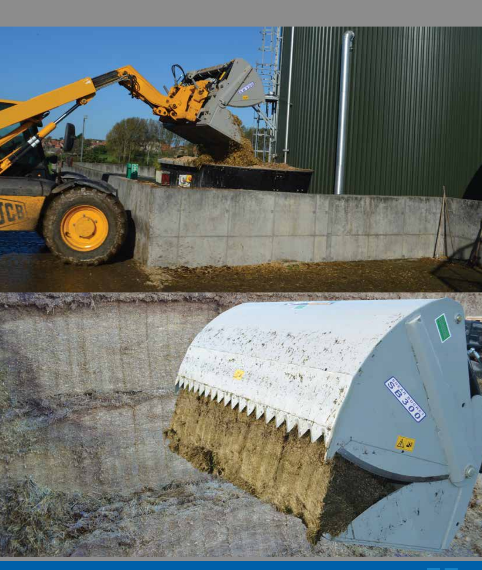
versatile machine that you will ever own.