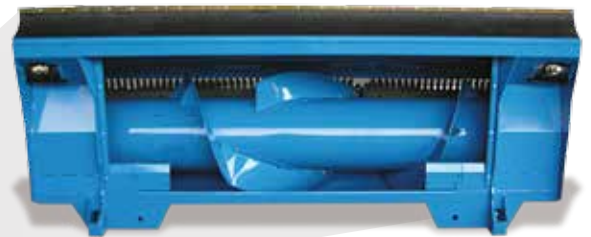
SPIRAL AUGER PADDLES