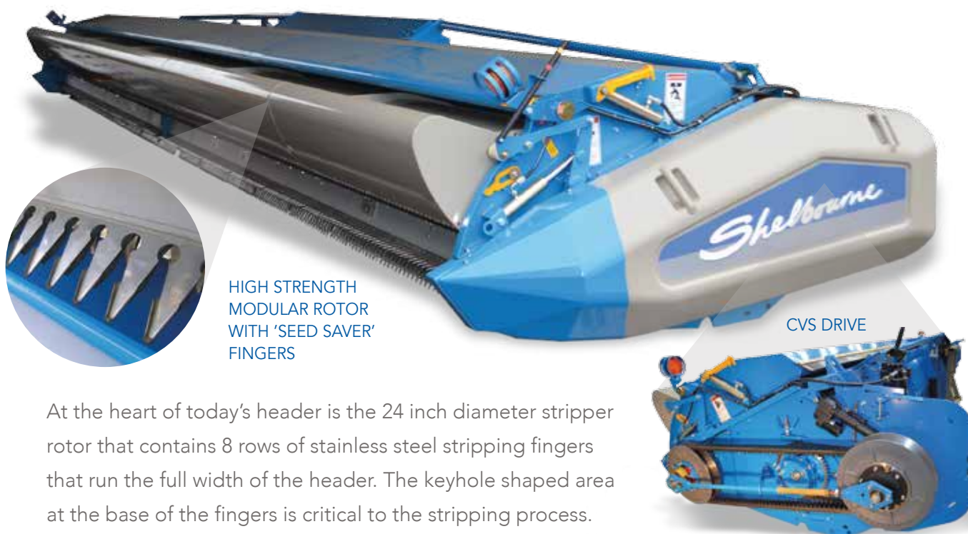
HIGH STRENGTH MODULAR ROTOR WITH 'SEED SAVER' FINGERS

The Shelbourne Header has been developed to reduce the amount of straw being taken into the combine and significantly increase its capacity.