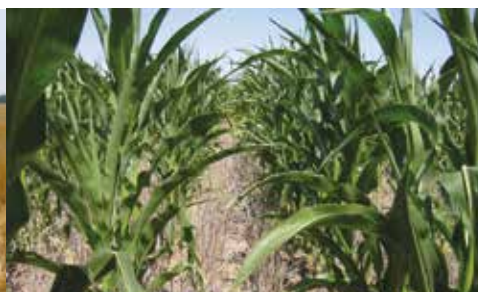
• No-till Corn in Wheat Straw