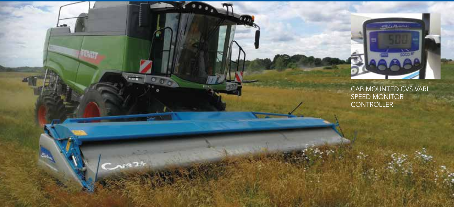
CAB MOUNTED CVS VARI SPEED MONITOR CONTROLLER

SHELBOURNE REYNOLDS HAS RECOGNISED THAT THE LIMITING FACTOR IN COMBINE PERFORMANCE IS THE ABILITY OF THE MACHINE TO HANDLE LARGE AMOUNTS OF STRAW AND SEPARATE GRAIN FROM IT.