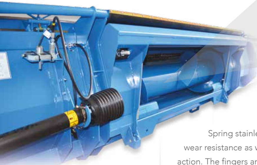
ADAPTOR PLATES TO SUIT MOST COMBINES

The fingers, when mounted to the rearwards spinning rotor, comb through the crop, picking it up if it is lodged or lying down and feeding the grain heads back into the keyhole shaped stripping area. The grain is quickly and cleanly stripped from the head and fed into the auger trough.