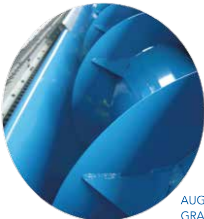
AUGER & GRAIN PAN

Spring stainless steel flange tipped fingers give increased wear resistance as well as providing a more aggressive stripping action. The fingers are orientated with the cups facing upwards to aid in stripping hard threshing varieties. These cups also contain the grain and control its trajectory as it moves through the header.