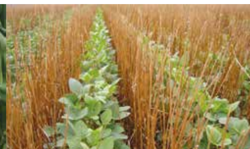
• No-till Beans in Wheat Straw